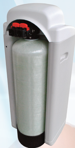
Two piece cabinet design

Uses up to 75% less salt & 64% less Water!!!