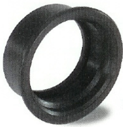
H400R Stop 'n Seal Inlet Hub