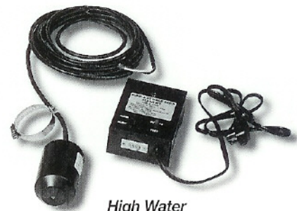
High Water Alarm