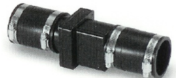
CV200R Check Valve