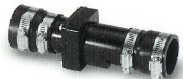
CVSUMPR Check Valve