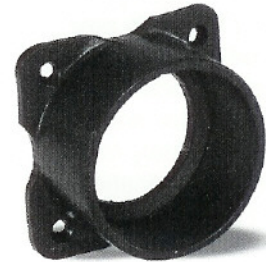
H300C Cast Iron Caulking Hub