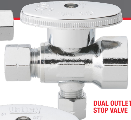
DUAL OUTLET STOP VALVE