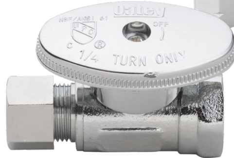
STRAIGHT STOP VALVE