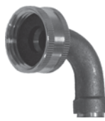
3/8" x 3/4" Whirlpool Elbow