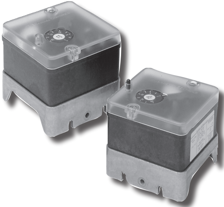
Model - G

Antunes Controls' new line of Gas Pressure Switches monitors gas pressure and breaks the electrical control circuit when pressure drops below or rises above the desired set point. The gas pressure settings are adjustable and all models are available in manual or automatic reset operation.