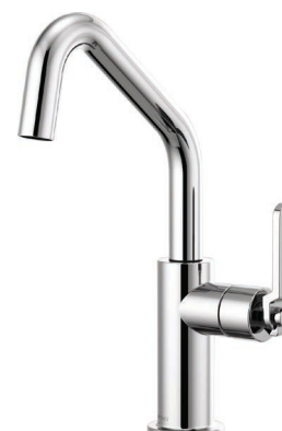
BAR WITH ANGLED SPOUT AND INDUSTRIAL HANDLE 61064LF