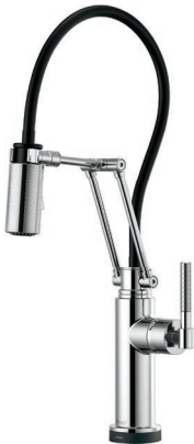
SMARTTOUCH® ARTICULATING WITH KNURLED HANDLE 64243LF