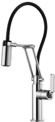
ARTICULATING WITH INDUSTRIAL HANDLE 63244LF