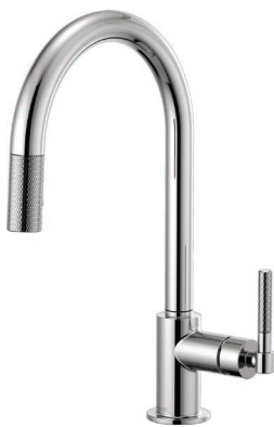
PULL-DOWN WITH ARC SPOUT AND KNURLED HANDLE 63043LF