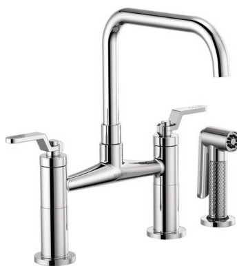
BRIDGE WITH SQUARE SPOUT AND INDUSTRIAL HANDLE 62554LF