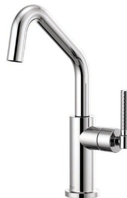
BAR WITH ANGLED SPOUT AND KNURLED HANDLE 61063LF