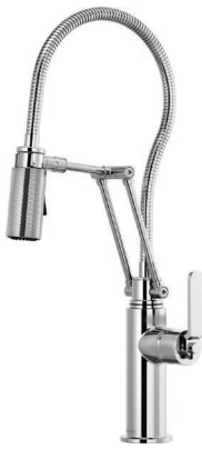
ARTICULATING WITH FINISHED HOSE AND INDUSTRIAL HANDLE 63144LF