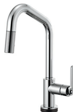
SMARTTOUCH®PULL-DOWN WITH ANGLED SPOUT AND INDUSTRIAL HANDLE 64064LF