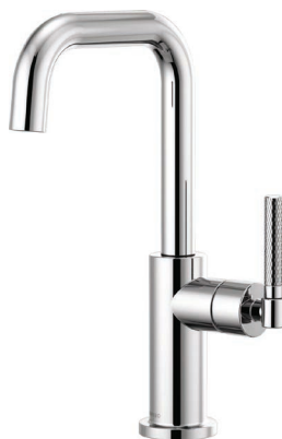
BAR WITH ARC SPOUT AND KNURLED HANDLE 61053LF