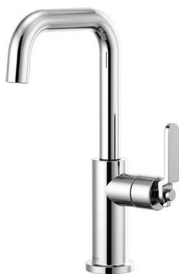
BAR WITH SQUARE SPOUT AND INDUSTRIAL HANDLE 61054LF