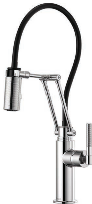
ARTICULATING WITH KNURLED HANDLE 63243LF