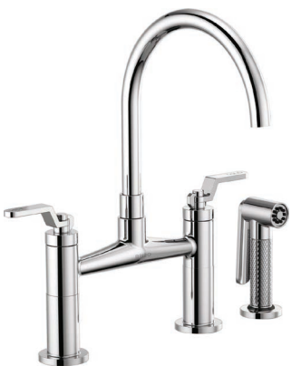
BRIDGE WITH ARC SPOUT AND INDUSTRIAL HANDLE 62544LF