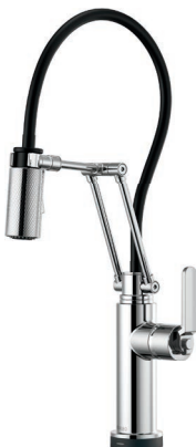
SMARTTOUCH® ARTICULATING WITH INDUSTRIAL HANDLE 64244LF