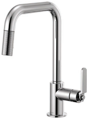
PULL-DOWN WITH SQUARE SPOUT AND INDUSTRIAL HANDLE 63054LF