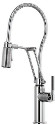
ARTICULATING WITH FINISHED HOSE AND KNURLED HANDLE 63143LF