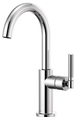
BAR WITH ARC SPOUT AND KNURLED HANDLE 61043LF