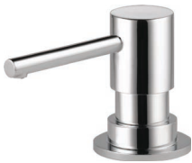
SOAP/LOTION DISPENSER RP79275

ACCESSORIES AVAILABLE IN MATTE BLACK TO COORDINATE WITH MATTE BLACK/BRILLIANCE® LUXE GOLD™ FINISH (BLGL)