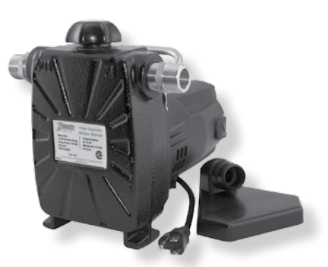
NOTE: Each pump is equipped with a suction screen and an extra set of brushes