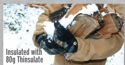
Insulated with 80g Thinsulate