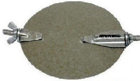
7 - KWIK-WAY ROUND DAMPER