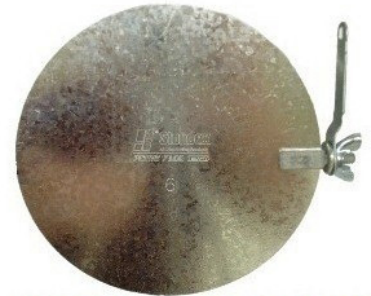
9 - DAMPER W/ PIN & HANDLE