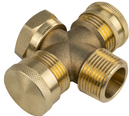
3/4" FIP Swivel 1 x 3/4" MIP x 3/4" MIP (cap) x 3/4" MHT (cap)