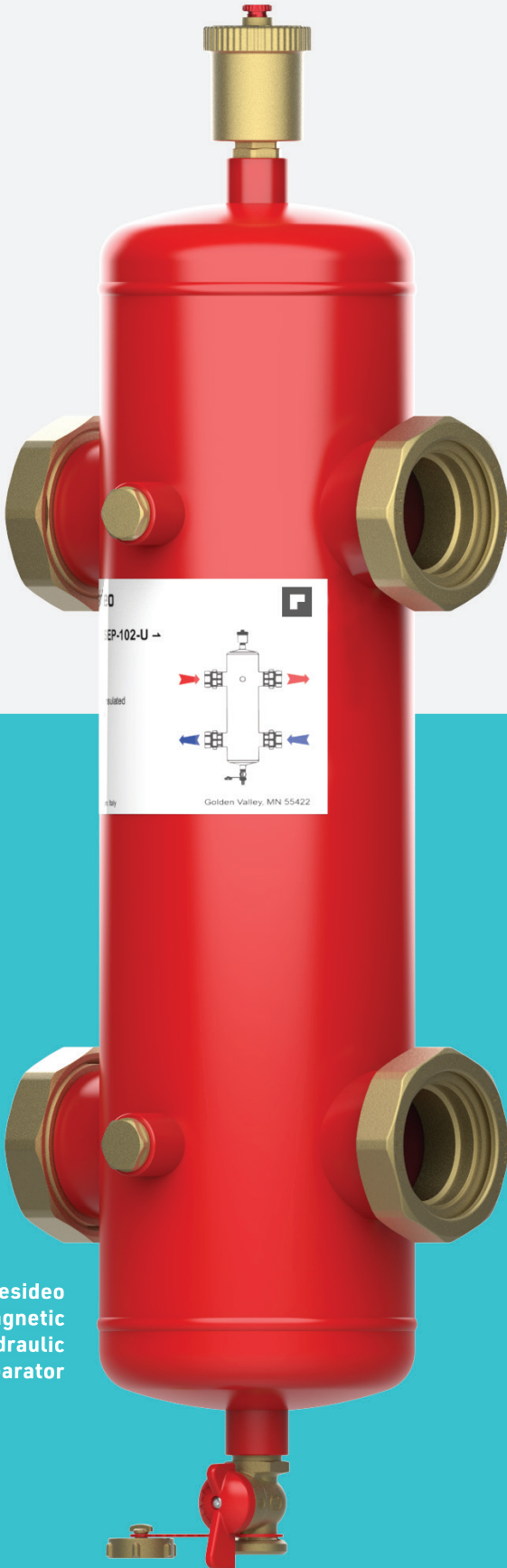
Resideo Magnetic Hydraulic Separator

The new Resideo Magnetic Hydraulic Separator protects modern hydronic installs through air, debris and ferrous removal, plus critical flow management between connected hydraulic circuits. Now it's easier for you to create a balanced hydronic system that delivers the comfort and efficiency customers want while minimizing callbacks.