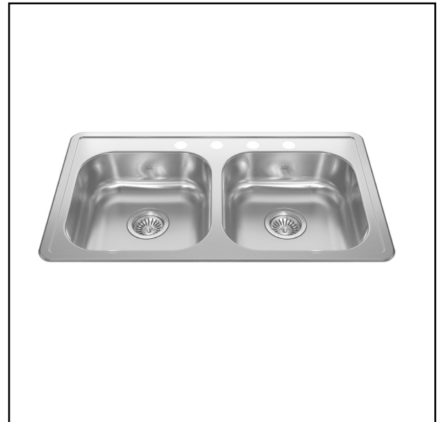
Creemore Topmount/Drop In