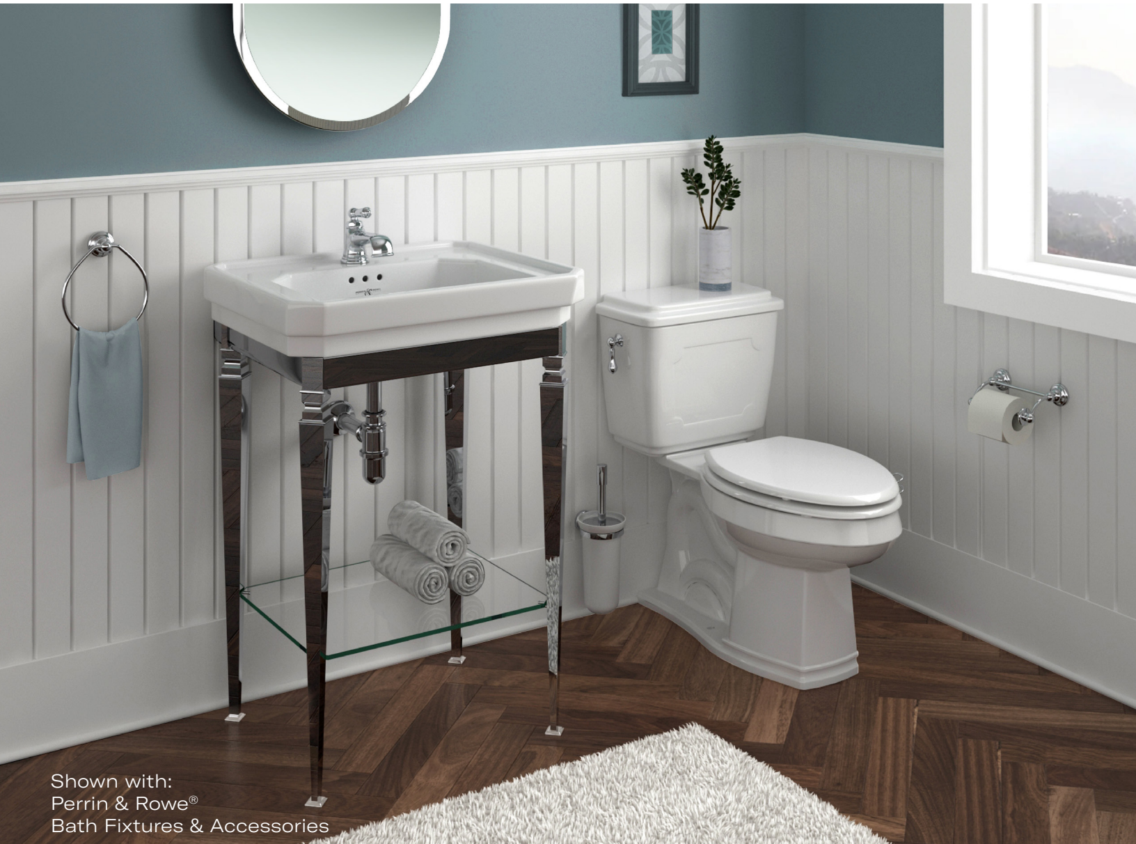
Shown with: Perrin & Rowe® Bath Fixtures & Accessories