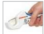
Easy Open & Close