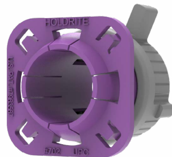
#702 Pipe Support Clamp