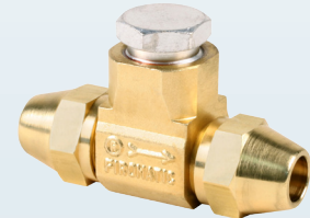
Part No. 12420