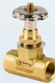
Part No. 12110