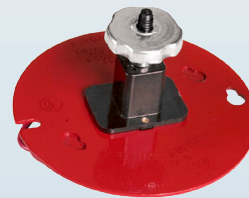
Part No. 12527