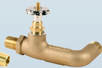
Part No. 12350