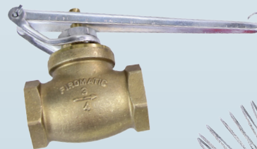
Part No. 12526