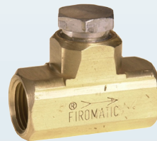
Part No. 12410