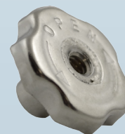
Part No. 12510