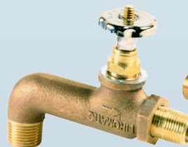
Part No. 12340