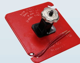
Part No. 12501