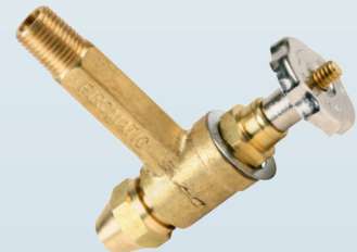
Part No. 12230