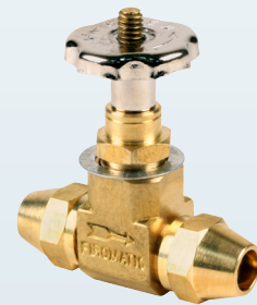
Part No. 12140