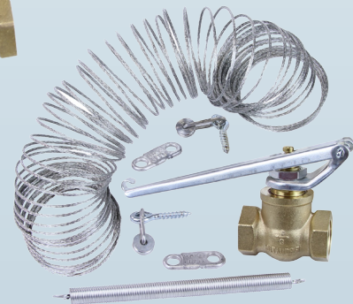
Part No. 12523

MPT = Male Pipe Thread, FPT = Female Pipe Thread, ODF = OD Flare