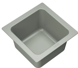
Prep Bowl 7" x 7"

Pair the small colander and prep bowl in the bridge for a multipurpose prep station. The colander is perfect for rinsing, and the bowl is ideal for collecting stems or peels. Made from Polypropylene. Dishwasher safe.