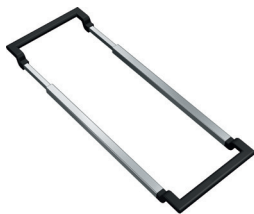
Telescopic Bridge 7" x Extends to 24"

Featuring extendable stainless steel rails that will adjust to fit bowls up to 21 1/4". Incorporates small feet that sit against the sink edge to ensure a stable fit. Durable handles protect sink. Holds up to 22lbs of weight.