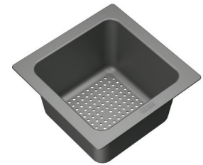
Small Colander 7" x 7"

With silicone feet built into its underside, the bamboo board can be positioned above the sink rim, or securely fitted onto the bridge's stainless steel rails.