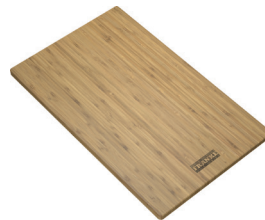
Bamboo Chopping Board 8" x 13"

Featuring extendable stainless steel rails that will adjust to fit bowls up to 21 1/4". Incorporates small feet that sit against the sink edge to ensure a stable fit. Durable handles protect sink. Holds up to 22lbs of weight.