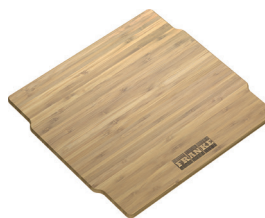
Bamboo Bowl Lid 7" x 7"

The small bowl can be used for collecting prepared ingredients and storing them in the fridge. Equally, it can be used for collecting peelings and dealing with waste during preparation. Made from Polypropylene. Dishwasher safe