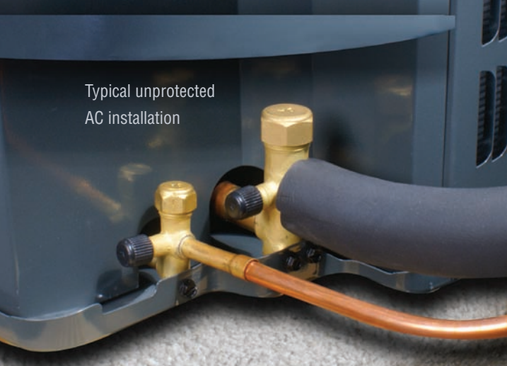
Typical unprotected AC installation

It's in the Code. Effective February 2009 the International Mechanical Code and International Residential Code now require that all outdoor access ports on A/C Refrigerant circuits be made tamper resistant.