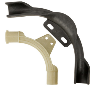
550-PB2 & 550-PB3