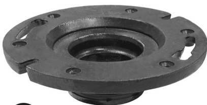
CAST IRON Two Finger Flange*