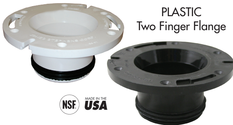
PLASTIC Two Finger Flange