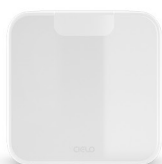
Cielo Breez Max